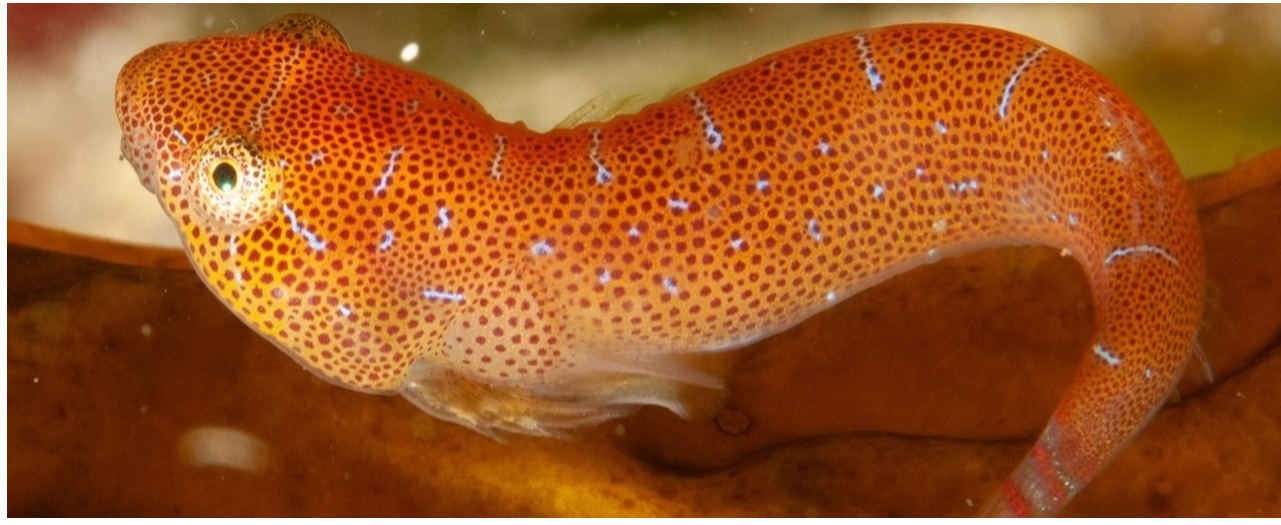
Eastern Cleaner Clingfish ( Cochleocephalus orientalis ) - Observation