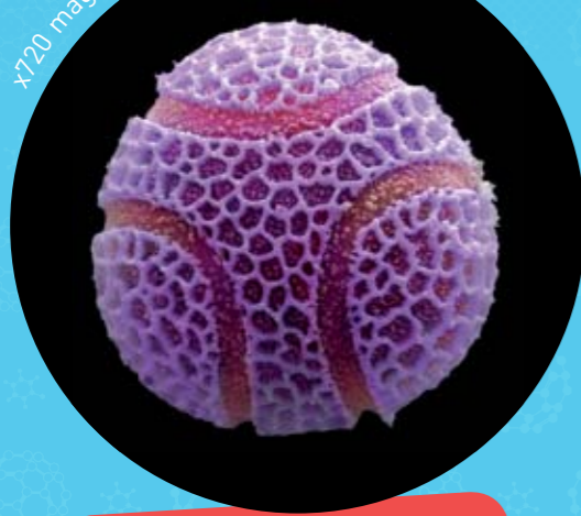
Passion flower pollen