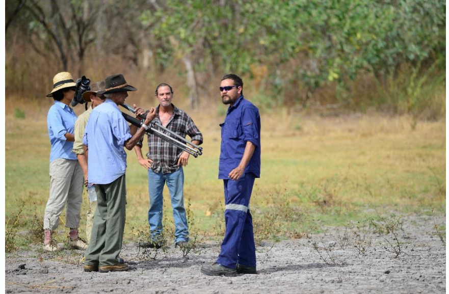
Filming on country with Olkola Traditional Owners.