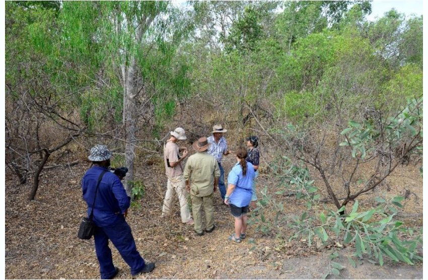
Olkola Traditional Owners talking about their country with the project team.