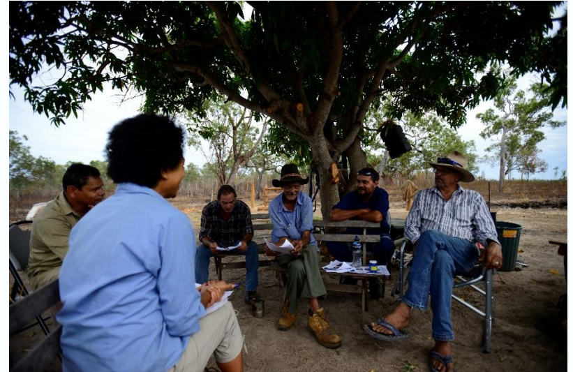
Olkola Traditional Owners talking with the project team at Killarney station.